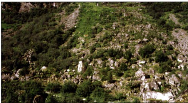
Fig. 2. The rockfall deposit seen from the eastern valley side. Note the large boulders along the avalanche front lobe.