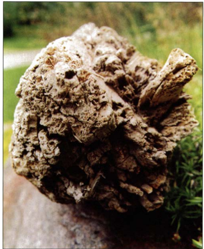
Fig. 4. Detail of one of the splintered ends of a Betula sp. trunk.