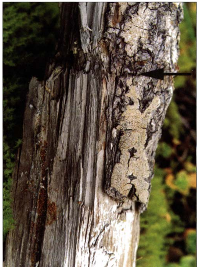
Fig. 5. Surface detail of the tree trunk in Figure 4 showing a deep crack into the wood (arrow).